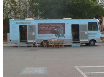
Van of Enchantment

Festival of the Cranes, Bosque del Apache (approximately near the fire station and the Wolf Man), Socorro